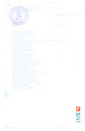
MM Sceince 2.jpg 312K