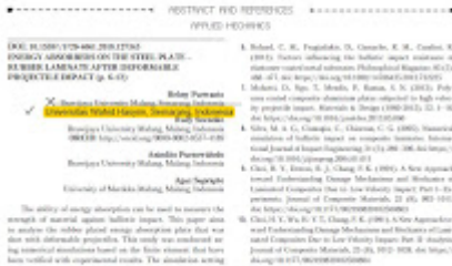
corection 2.jpg 100K

Eastern-European Journal of Enterprise Technologies ISSN 1796-3774 2022, 1(1): 1-10