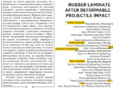
corection 1.jpg 136K

Eastern-European Journal of Enterprise Technologies ISSN 1796-3774 2022, 1(1): 1-10