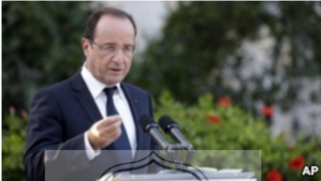
Presiden Perancis François Hollande dalam konferensi pers setelah menghadiri KTT Negara-negara Wilayah Laut Tengah mendesakkan perlunya campur tangan militer untuk menyelesaikan masalah di Mali utara (foto, 5/10/2012).