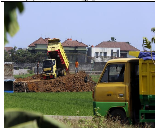
7. Foto Pembangunan Perumahan di Kecamatan Gringsing Kab. Batang