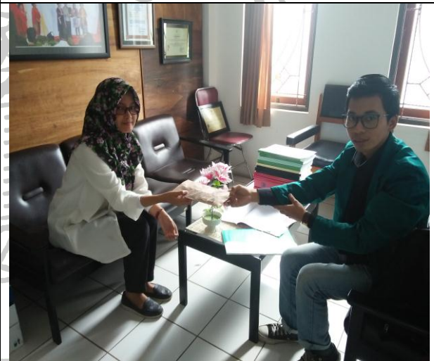
4. Pemberian surat perizinan dari Kepala BAPEDA