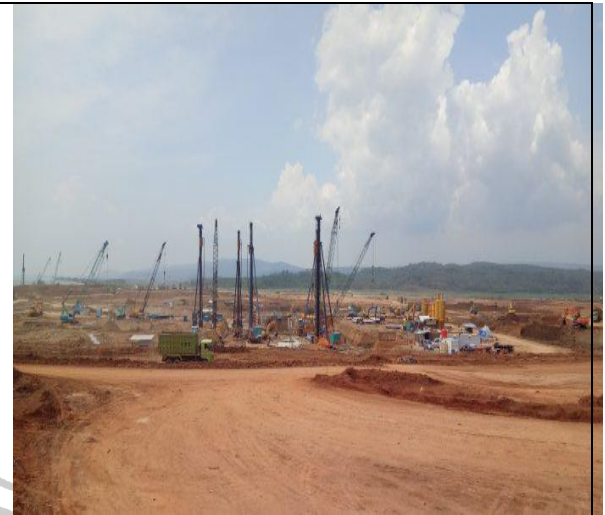
6. Foto Pembangunan PLTU di Kecamatan Kandeman Kab. Batang