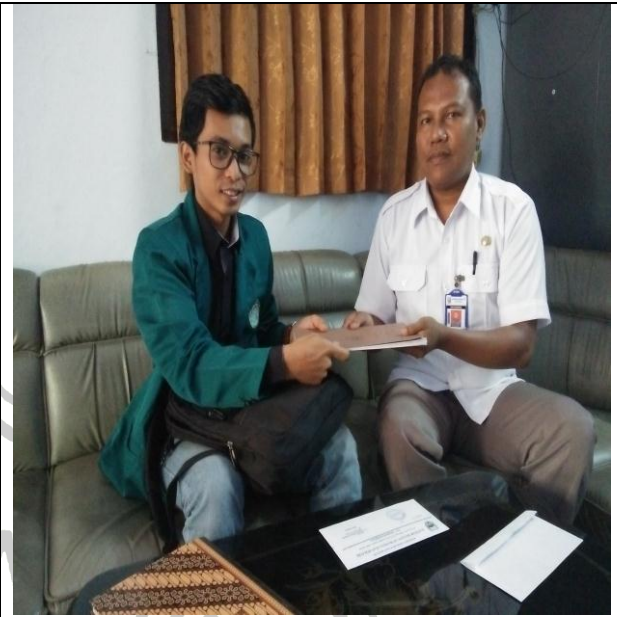
2. Pemberian Proposal Skripsi