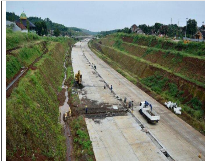
5. Foto Pembangunan Jalan Tol di Kecamatan Banyuputih Kab. Batang