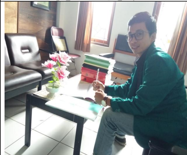
3. Pengisian data diri di Ruang Kepala BAPEDA